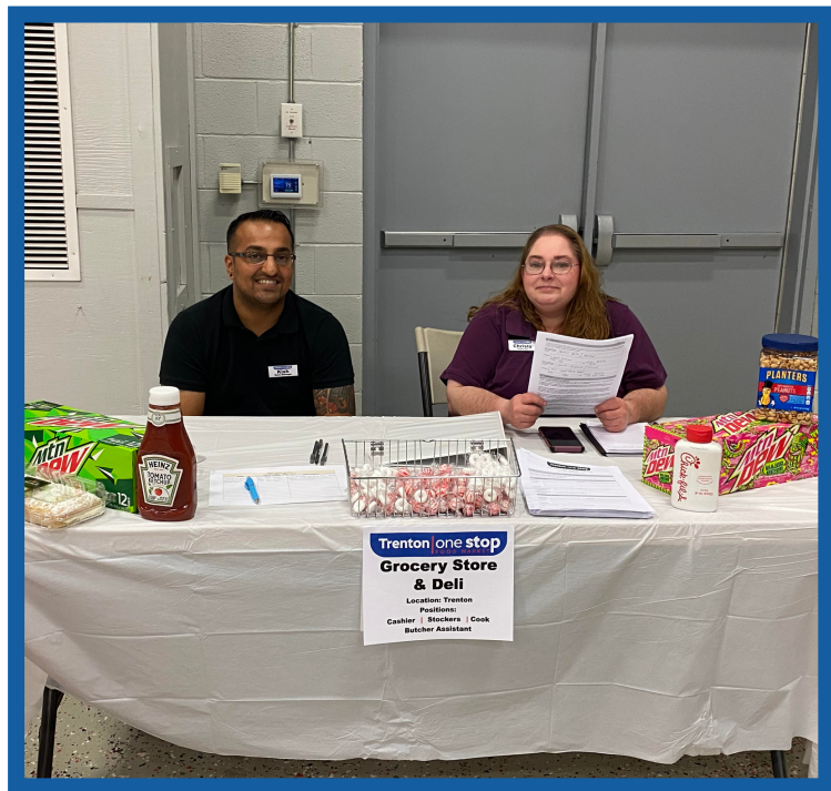
Employer Trenton One Stop