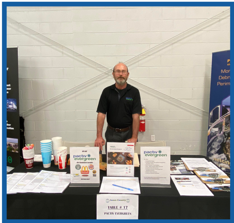
Employer Pactiv Evergreen